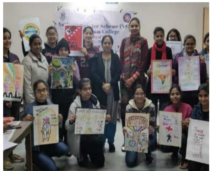
NSS volunteers participating in the event