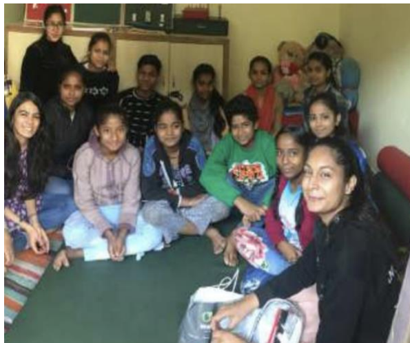
NSS volunteers donating clothes to the needy people