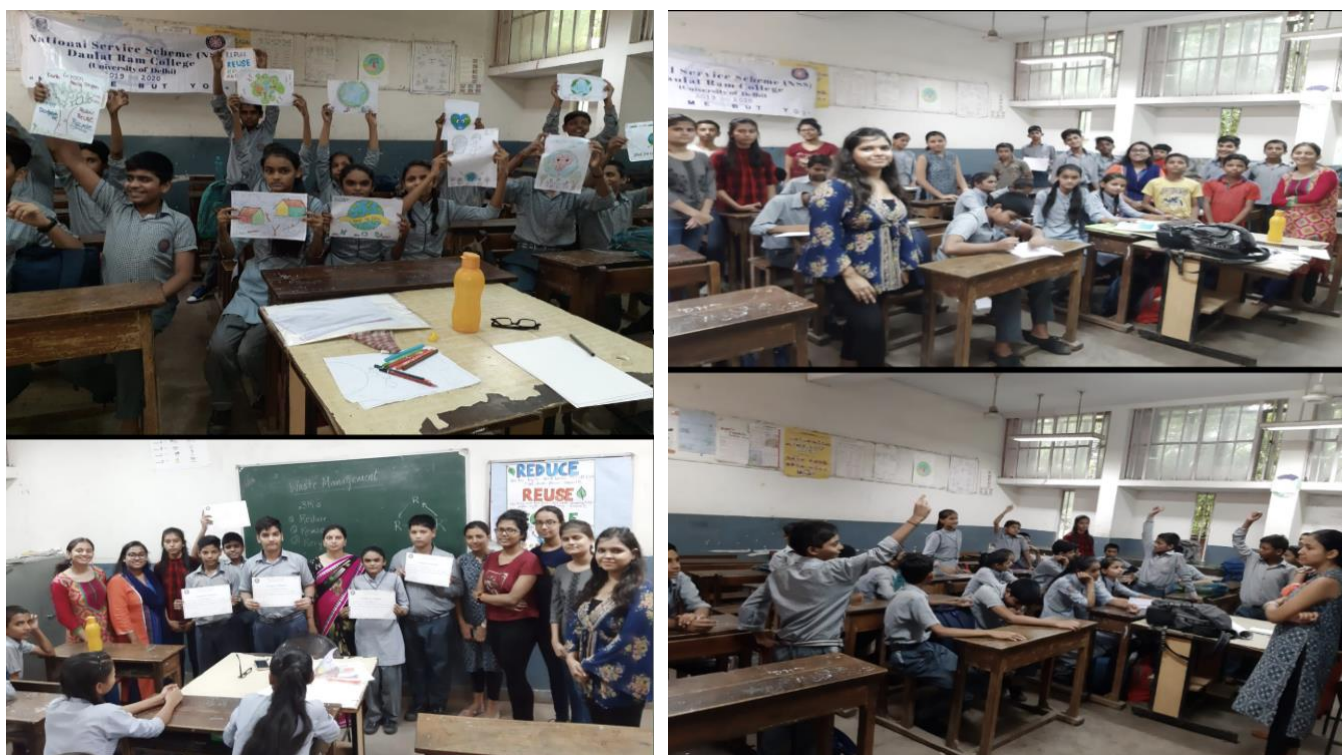
NSS volunteers participating in Awareness campaign in school

Report: Volunteers of NSS DRC visited Delhi University Social Centre Co-Ed Secondary School in Maurice Nagar, Delhi on 27th July 2019. The volunteers interacted with the students. They informed the students about the current statistics of waste production and took up their concerns and suggestions. It was an interactive and informative session. The volunteers were happy to see the enthusiasm and curiosity of the children and willingly answered all their queries. Poster making competition was one among the several activities undertaken in Delhi University Social Centre Co-Ed Secondary School.