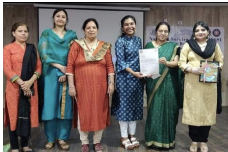
NSS volunteers participating in the event