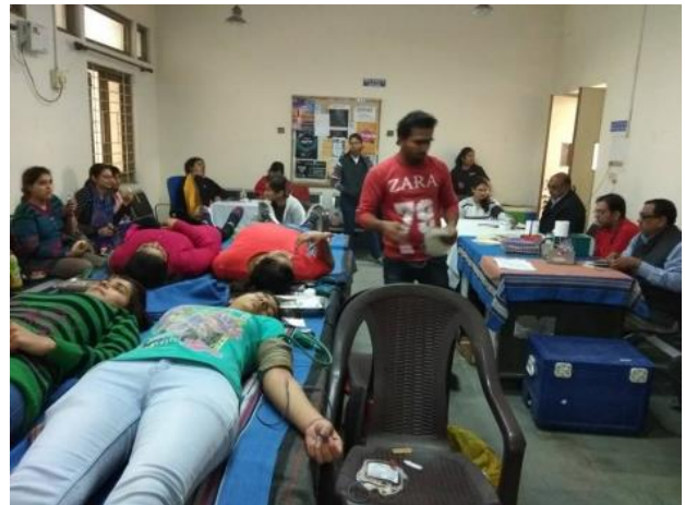
NSS volunteers donating blood for social cause