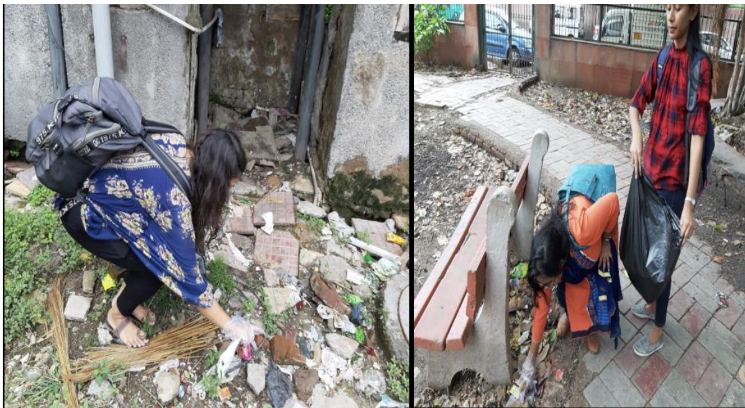
NSS volunteers performing waste collection drive

Report: The Ministry of Jal Shakti, in association with the Ministry of Youth Affairs and Sports, and HQ NCC has launched the Swachh Bharat Summer Internship 2019 – 50 Hours of Swachhata, an initiative that gave an opportunity to youth across the country to become a part of the Swachh Bharat jan andolan. The volunteers organised a waste collection drive in the North Campus, University of Delhi and its surrounding area. Volunteers collect waste from the college, parks and streets. The volunteers participated with full enthusiasm. Throughout all the activities undertaken from 10th June to 31st July 2019. The initiate was a wonderful opportunity for the volunteers and helped them develop more passion towards social service.