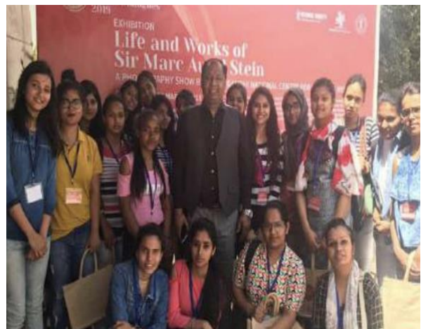
NSS volunteers participating in the event