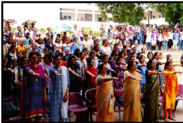
NSS Volunteers with faculty members taking oath

Report: To commemorate Swachhta Pakhwara, under the positive initiative of Swachh Bharat Abhiyaan, the National Service Scheme Daulat Ram College Unit organised an oath taking ceremony on 3 rd August. The ceremony witnessed the participation of more than 200 student volunteers, respected members of the non-teaching staff of the college, as well as teachers undertaking the pledge towards ensuring cleanliness in their surroundings.