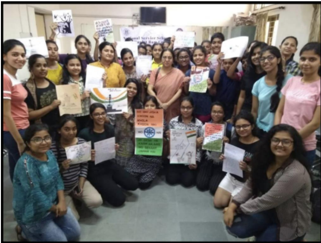
NSS volunteers showcasing their posters

Report: On the occasion of the second anniversary of Surgical Strike, i.e. 29th of September 2018, the National Service Scheme (NSS) Unit of Daulat Ram College (DRC) organised an event on the theme Prakram Parv (Surgical Strike Day) to mark the day. 35 students and the NSS Union members actively participated in the event and expressed their respect for the soldiers in various forms related to the theme Prakram Parv. The students wrote letters to the soldiers, slogans on Patriotism, gratifying poems, and made creative posters. The event was a great success as the students passed on the message of love for our nation and respect for the army through their enthusiastic participation.