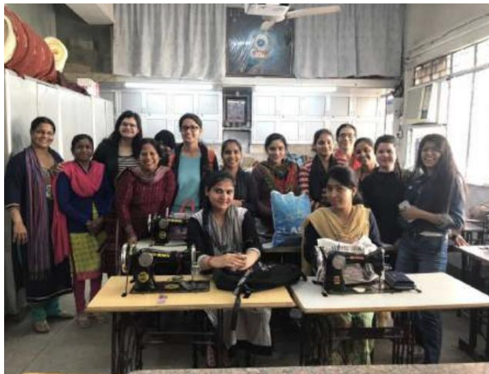
NSS volunteers participating in donation drive

Report: NSS Union along with 5 volunteers in the month of February at the conclusion of a successful donation drive visited the Delhi Foundation for Deaf Women and God Gives Everything NGO to help the underprivileged women and children with the sanitary napkins, toiletries and stationary.