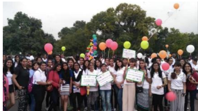
NSS volunteers attending the awareness rally