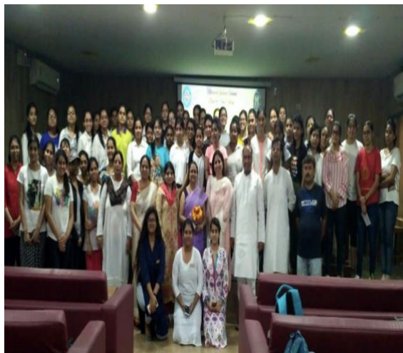
NSS volunteers attended talk on meditation