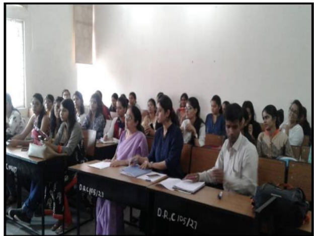
NSS volunteers participating in the event