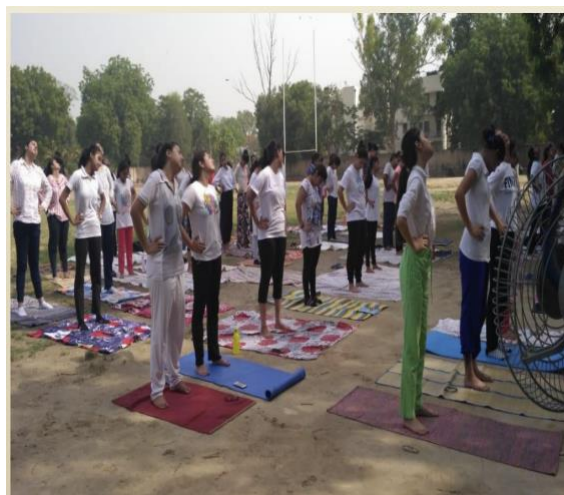
NSS volunteers practicing yoga during 7-day workshop