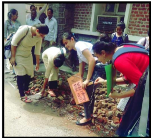
NSS volunteers cleaning the college premises