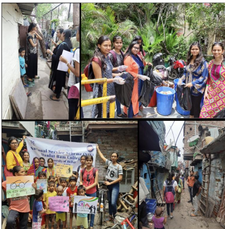
NSS volunteers participating in Awareness campaign in village

Report: The Ministry of Jal Shakti, in association with the Ministry of Youth Affairs and Sports, and HQ NCC has launched the Swachh Bharat Summer Internship 2019 – 50 Hours of Swachhata, an initiative that gave an opportunity to youth across the country to become a part of the Swachh Bharat jan andolan. In order to spread awareness about cleanliness and Solid waste management, a drive was conducted on 24 th of July, 2019 in a slum named 'Cigarette Wala Bagh' near GTB Nagar. The volunteers walked down the streets of the place talking to the residents and informing them about proper disposal techniques and importance of cleanliness. The volunteers also collected the waste on the streets and disposed it properly.