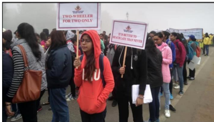
NSS volunteers participating in the walkathon organized by Delhi Police